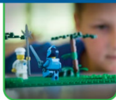
Stop Motion Animation